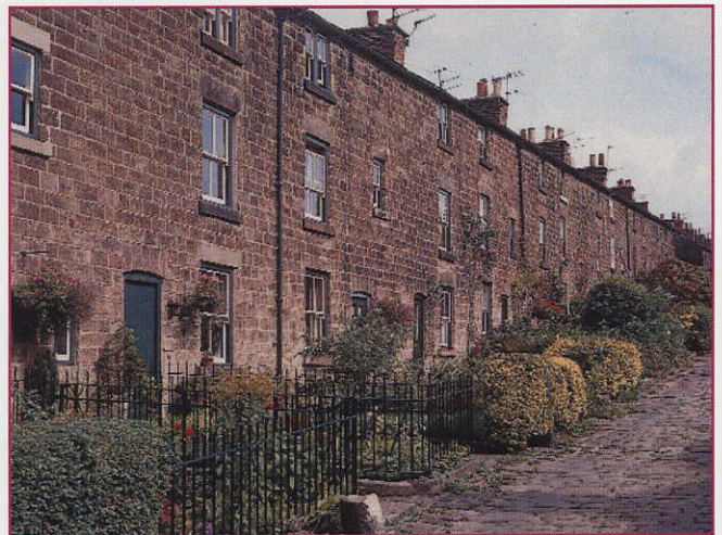
Houses built for workers at the mills

B Turn right down the hill and when you reach the Chevin road after two fields turn left. Then after the 30 mph signs take the first turning on your right and follow the series of paths to rejoin your outward path alongside the river to the mill. 7.5 km