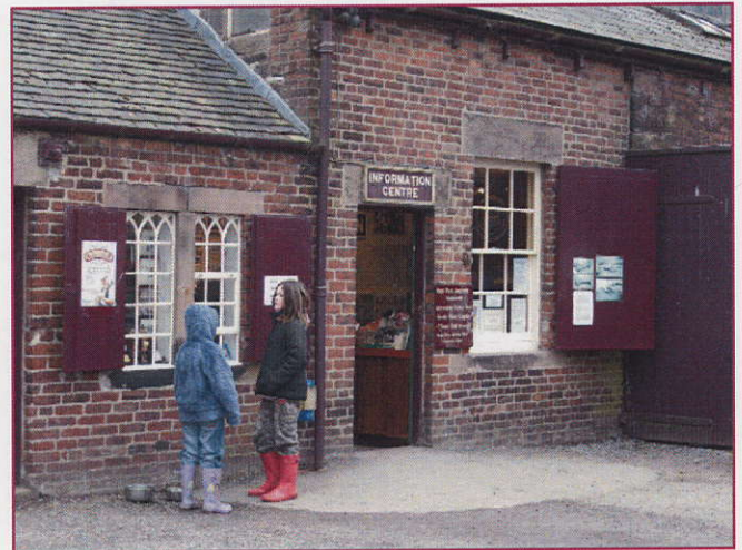
High Peak Junction

C At High Peak Junction you have the choice of adding on an extra loop to the walk to create a slightly longer walk. The longer one involves a pleasant walk along the Cromford Canal and past the former home of Florence Nightingale.